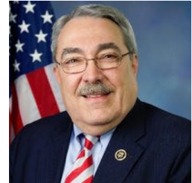
Rep. G.K. Butterfield (D-NC)

Congressman G.K. Butterfield of North Carolina is our 2018 Congressional Champion. As a senior Member of the House of Representatives, Congressman Butterfield led the fight to extend funding for the National Health Service Corps in Congress. As funding for the NHSC faced expiration, he rallied his colleagues to support this important program, garnering bipartisan support for his bipartisan bill, the NHSC Strengthening Act of 2017. Congressman Butterfield truly understands the critical role the NHSC plays in recruiting clinical providers to underserved communities, and has seen firsthand the positive impact of the program at health facilities across his rural North Carolina district. We greatly appreciate his successful effort to extend funding for the NHSC and are proud to name him as our Congressional Champion for 2018!